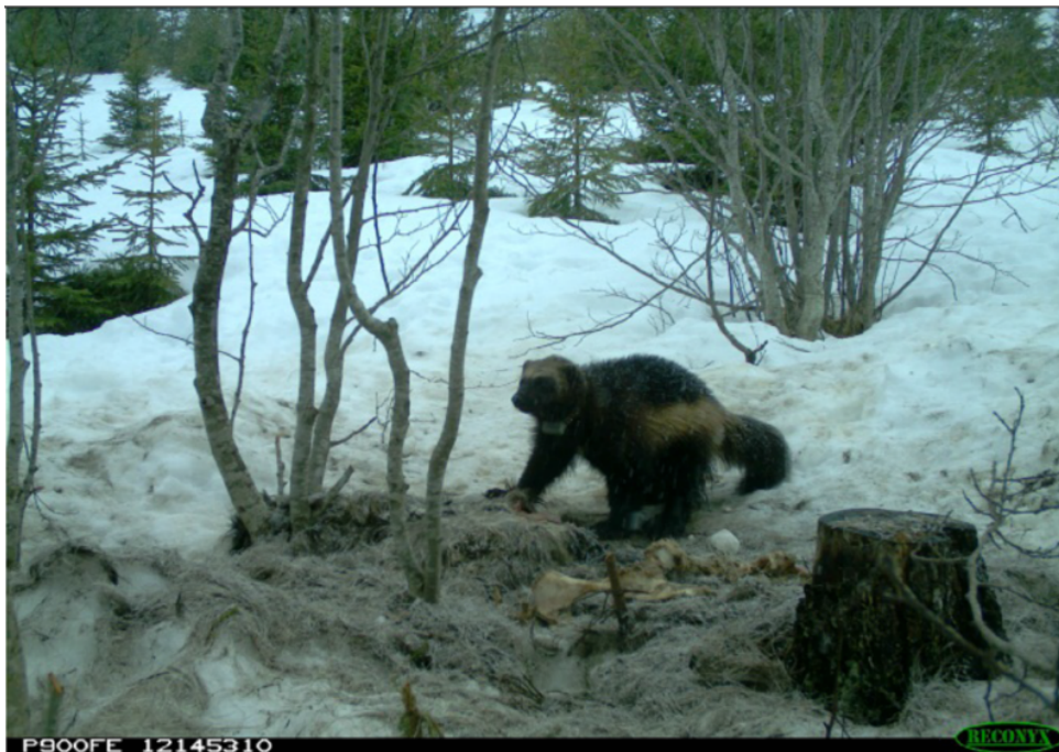
Scandinavian wolverine on moose carcass